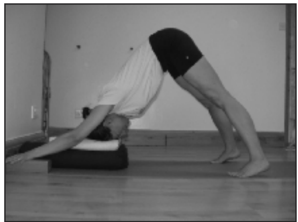
Adho Mukha Śvānāsana