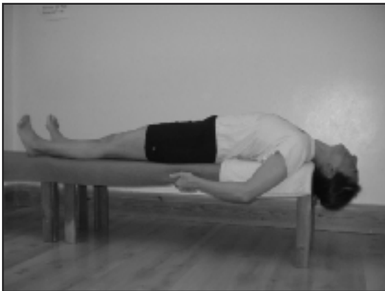
Bench neck curvature