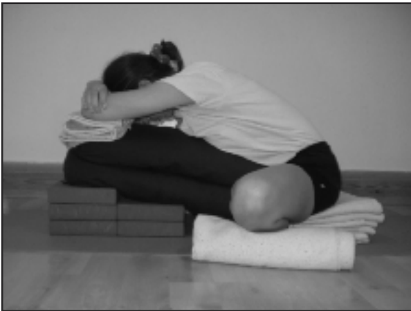
Adho Mukha Baddha Koṅāsana