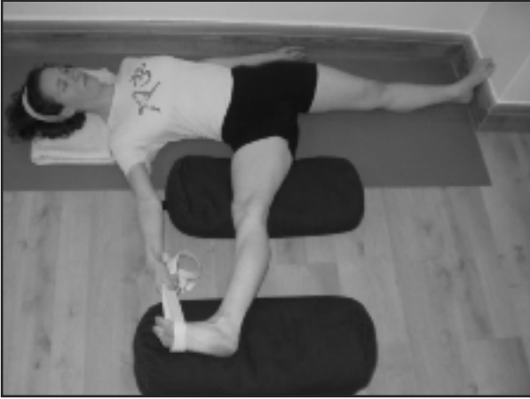
Supta Pādānguṣṭhāsana II