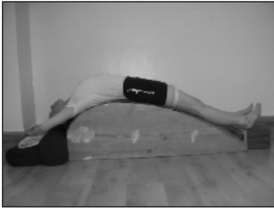
Viparīta Daṇḍāsana on a bench