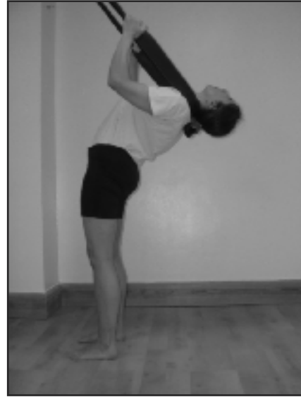
Rope neck curvature