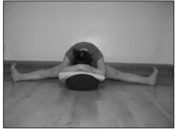
Adho Mukha Upaviṣṭha Koṇāsana