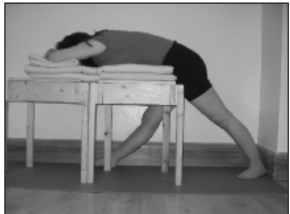
Pārsvottānāsana Head Down