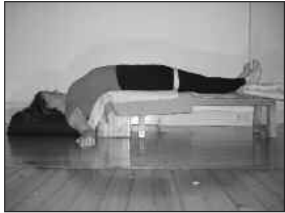
Setu Bandha on a bench