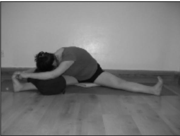
Pārśva Upaviṣṭha Koṇāsana