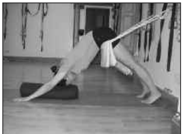
Adho Mukha Śvānāsana on a rope