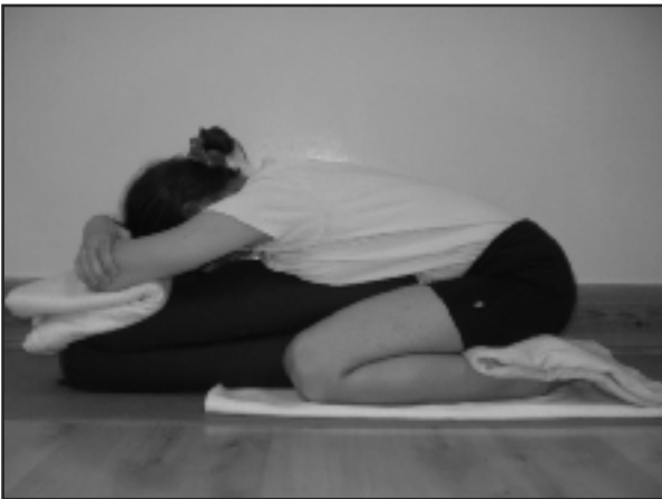
Adho Mukha Virāsana