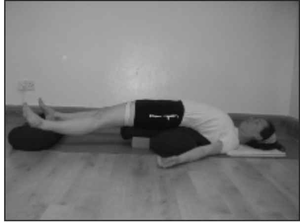
Cross bolster Setubandha

Now, after supine āsana-s one should do forward extensions ( Paśchima Pratana Sthiti ). The āsana-s like Adho Mukha Virāsana , Adho Mukha Svastikāsana , Adho Mukha Baddha Koṇāsana , Jānu Śīrṣāsana , Triāṅg Mukhaikapāda Paśchimottānāsana , Ardha Padma Paśchimottānāsana , Marīchyāsana , Adho Mukha Upaviṣṭha Koṇāsana , Pārśva Upaviṣṭha Koṇāsana , and Paśchimottānāsana are the main āsana-s that come under this category. In these postures women are given bolsters so that they rest their foreheads on the bolster. In a usual practice, if you do not use the bolster, you want to extend your body forward and the forehead rests on the shinbone, but here a woman has to respect her energy level, her body state and so on.